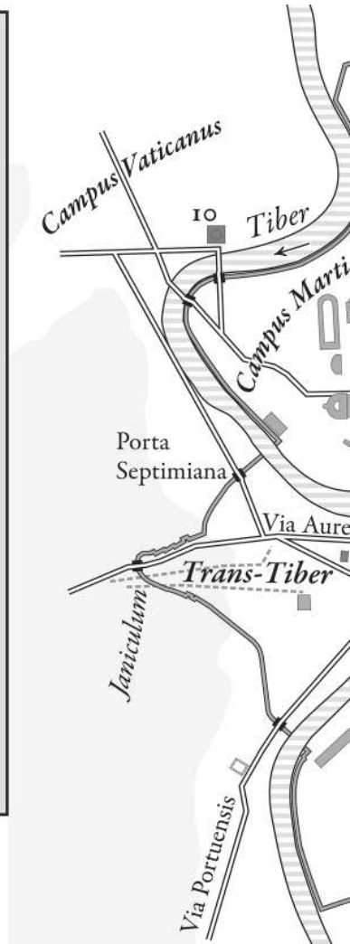
Map 2 Rome in 275.